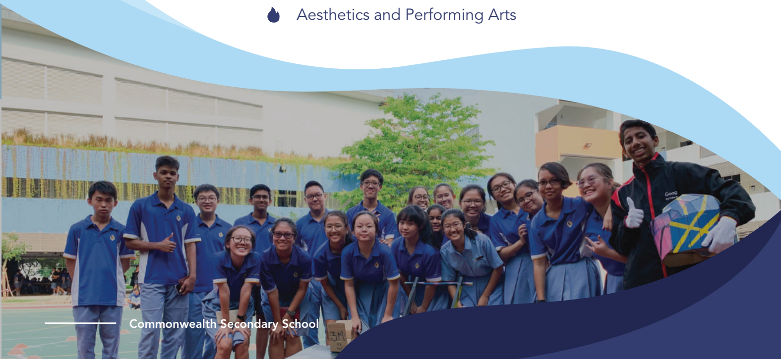
Commonwealth Secondary School